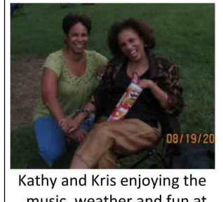
music, weather and fun at our JazzFest!